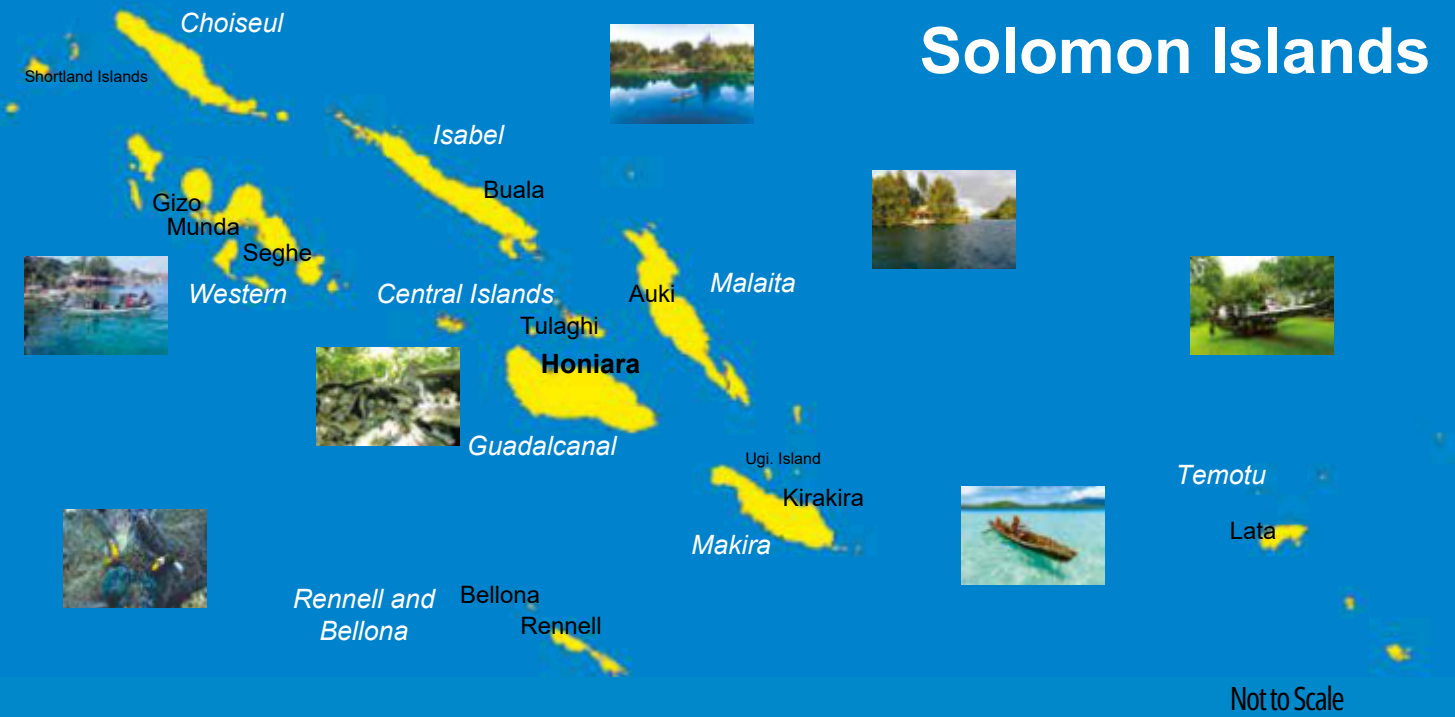
Map of The Solomon Islands, not to scale