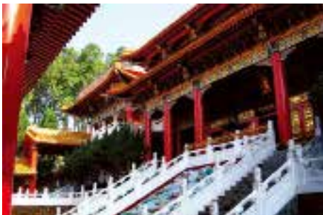
Sun Moon Lake

Access to the Central area of Taiwan, from either Taipei in the North or Kaohsiung in the South, is by air, road or rail. Rail is the most frequent and popular as the rapid transit trains are inexpensive and circle the whole of Taiwan. Venturing into the heart of Taiwan is done by road once you have arrived in Taichung or Chiayi and we recommend travelling with an English speaking guide as travel in these areas can be complicated without local knowledge or Mandarin Chinese language skills. Notable places to visit in the Central Taiwan region are Sun Moon Lake, Alishan and Taroko Gorge on the eastern side of the island. The central district is famous for its coffee, oolong tea, betel nut plantations, fruit growing, paper making and arts and crafts. The area is mountainous with roads clasped to the cliffs and plantations of tea, coffee, fruit trees, pineapples, and betel nut palms perched throughout. The region is spectacular and a photographer's paradise.