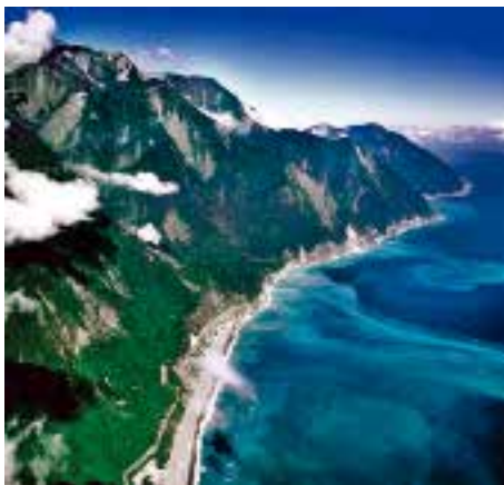
Jiji and Fenchi Lake

The home of oolong tea. Tea and arabica coffee plantations with tastings, ensure you will have a memorable time. Oolong tea can be sampled together with the local food cooked over an open, hot coal brazier.