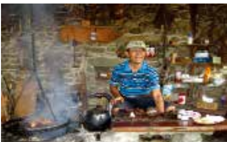
2 Day 1 Night, Sun Moon Lake Tour (Dep Mon to Thu)

The arrival point to visit the Taroko Gorge but also for fabulous coastal scenery. Whales and dolphin watching. White water rafting in summer.