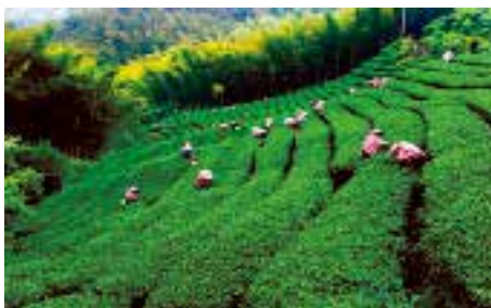
3 Day 2 Night, East/West Cross Island Scenic Tour

Visit pagodas, shrines, and local villages, then on to Alishan for Oolong tea tasting and Chiayi overnight before visiting the historical and cultural town of Lukang. Includes 2 night's accommodation with breakfast, transport, entry fees and English speaking guide. (ET)